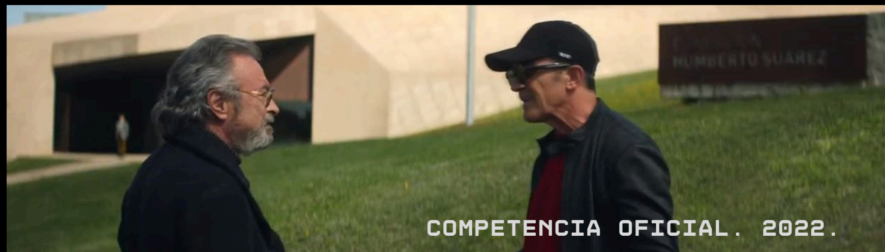
COMPETENCIA OFICIAL. 2022.

CONCEJALÍA DE TURISMO. TECNICOSTURISMO@AYUNTAVILA.COM TLF. 920 350 000 EXT 373-375 WWW.AVILATURISMO.COM