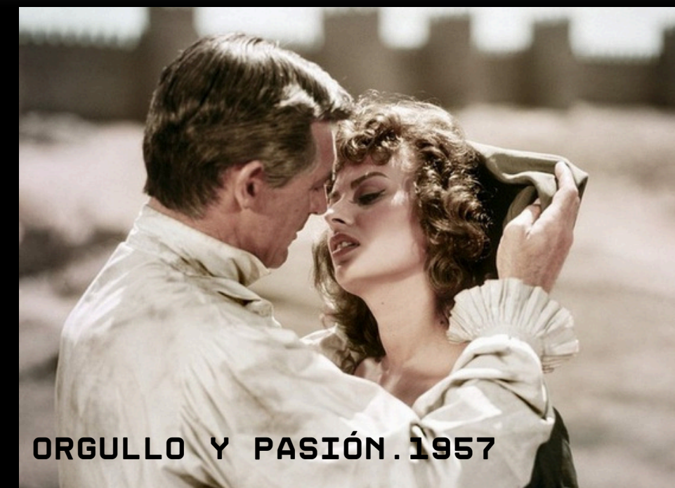
ORGULLO Y PASIÓN. 1957

HISTORY, HERITAGE, CULTURE, LANDSCAPES, NATURE, ARE DEFINITELY EXCELLENT LOCATIONS TO SHOOT IN AVILA.